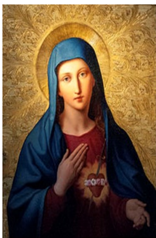
Painting of the Virgin Mary at Peterskirch - Vienna, Austria

The Immaculate Heart of Mary is venerated in August and embodies the desire of the Blessed Virgin to bring all people to her Son, Our Lord Jesus Christ. Our solemn dedication to the Immaculate Heart of Mary leads us to make amends for the sins that we have committed against